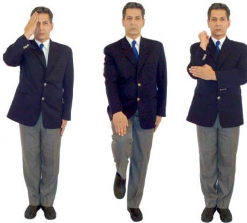
Attacks with the Head, Knees or Elbows - The Referee touches his forehead, knee or elbow with the open hand to indicate a Category II offense.