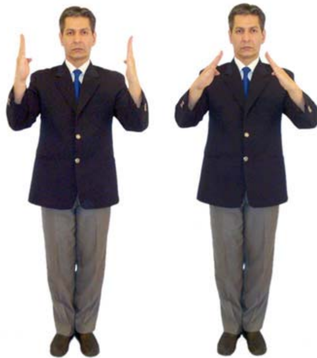
Otagai ni Rei - The Referee motions to the contestants to bow to each other.