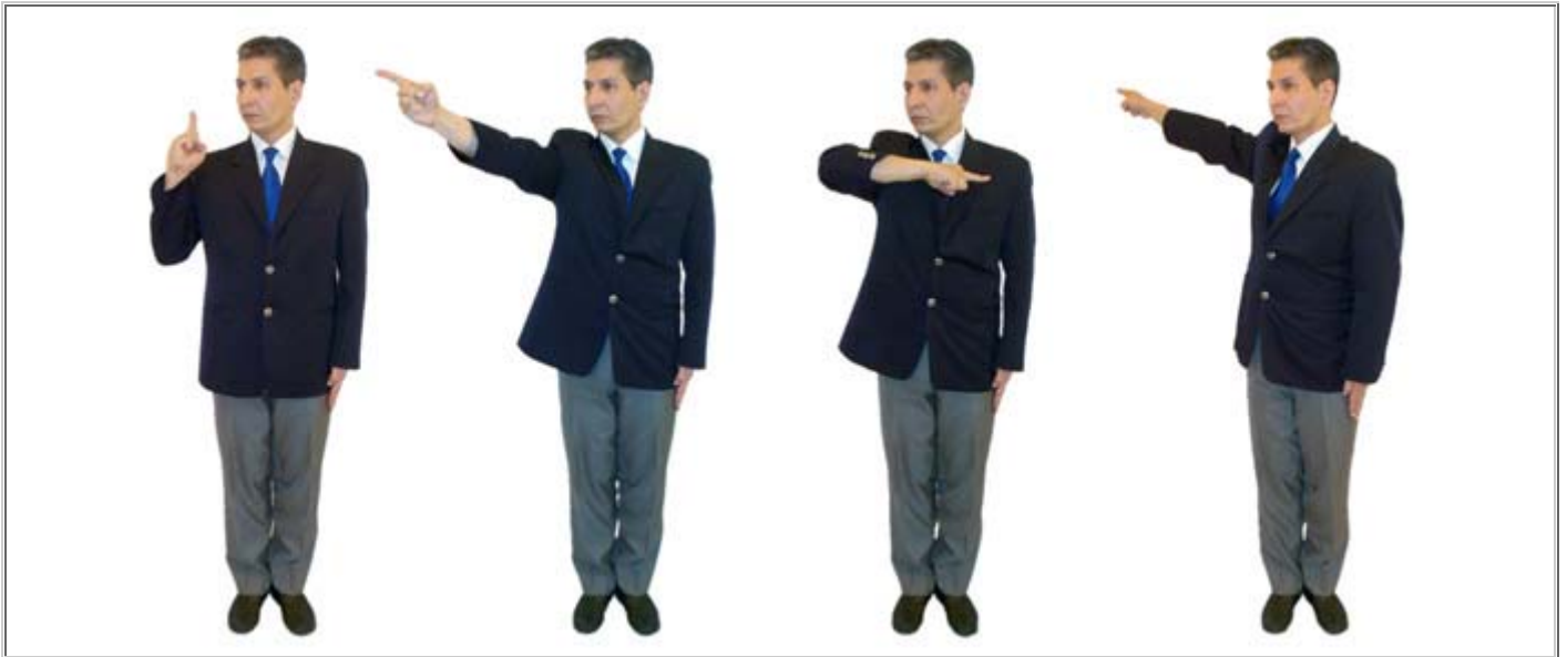
Shikkaku - "Disqualification, Leave the Area". The Referee points first upwards at 45 degrees in the direction of the offender then motions out and behind with the announcement "Aka (Ao) Shikkaku!" He then announces a win for the opponent.