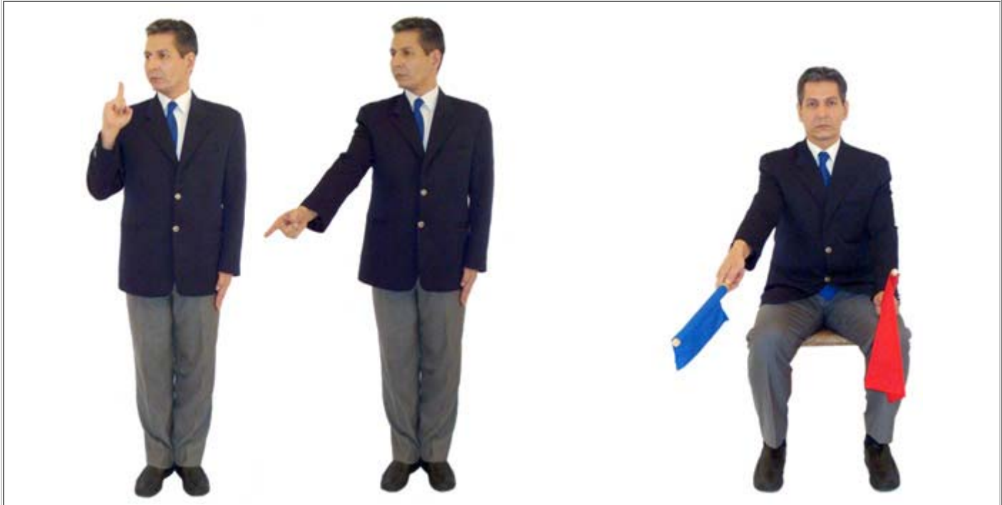
Keikoku is imposed where the contestant's potential for winning is slightly diminished by opponent's foul and Ippon (1 point) is added to the contestant's score.