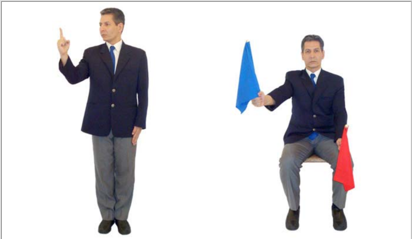
Category 2 Warning (Chukoku) May be imposed for attendant minor infractions or the first instance of a minor infraction.