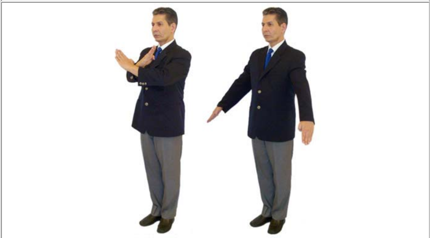
Cancel Last Decision - When an award or penalty has been given in error the Referee turns towards the contestant, announces "Aka" or "Ao" crosses his arms, then makes a cutting motion, palms downward, to indicate