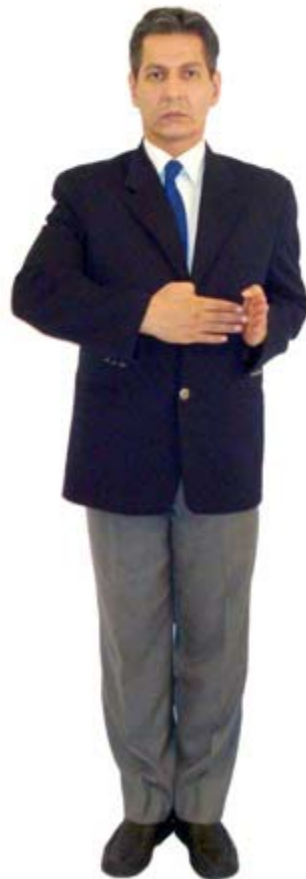
Aka (Ao) Scored First The Referee indicates to the Judges that Aka scored first by bringing the open right hand to the palms of the left hand. If Ao was first, then the left hand points to the right hand.