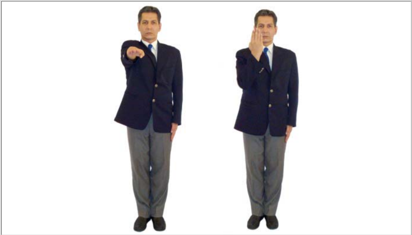
Shugo "Judges Called" The Referee calls the Judges at the end of the match or bout or to recommend Shikaku.