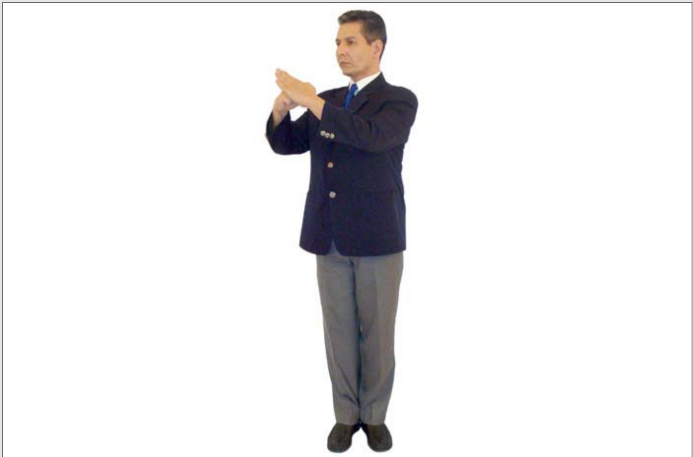
Excessive Contact The Referee indicates to the Judges that there has been excessive contact or other Category I offense.