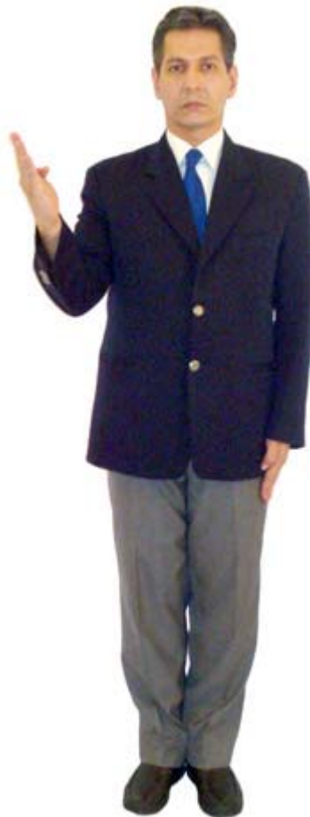
The Referee Opinion After calling "Yame" and using the prescribed signal, the Referee indicates his preference by holding his bent arm palm upwards on the side of the scoring contestant.